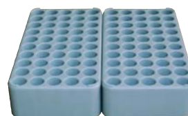
connected at lateral ends

SARSTEDT AG & Co. P.O. Box 12 20 D-51582 Nümbrecht Phone +49 2293 3050 Fax +49 2293 305-122 info@sarstedt.com www.sarstedt.com